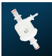
AseptiCap ® WL/WS-γ 1", 250cm 2