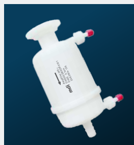
1 1/2" Sanitary Flange to 1/2" Barb Hose

mdi AseptiCap® WL/WS-γ filters are available in a wide range of end connections and are also customized to offer different inlet-outlet combinations to meet the unique connectivity needs in biopharmaceutical process assemblies where, for example, stainless steel components with sanitary flange connections are sometimes required to be connected to single use disposable systems through quick-connectors or hose barb connections.