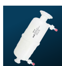
AseptiCap ® WL/WS-γ 8", 2000cm 2