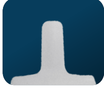
Male Luer Slip