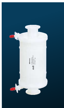
AseptiCap ® WL/WS-γ 5", 3000cm 2