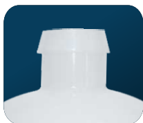
1" Hose Barb