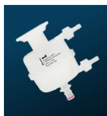
AseptiCap ® WL/WS-γ 2", 500cm 2