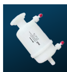
AseptiCap ® WL/WS-γ 5", 1000cm 2